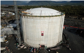
Top: Inside view of the tank. Bottom: Outside view of the tank.