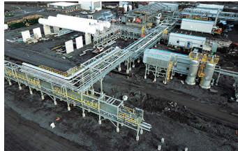
Top: Installation of balance of plant area modules. Bottom: Work continues on infrastructure to support facility build out.