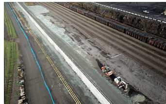
Top: Placement of rail-offloading modules. Bottom: Off-lease retaining wall along the rail corridor.